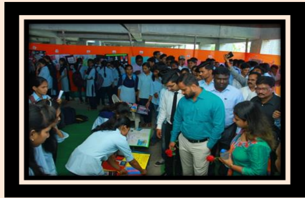
Honourable DM. of Larur shri G.Sreekanth inaugurated poster presentation event.